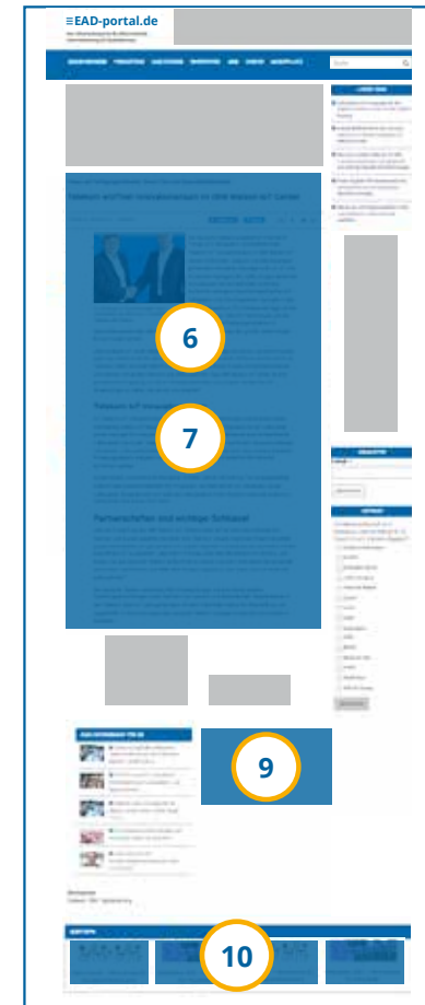
Article page desktop