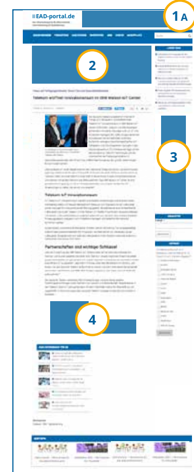
Article page desktop

4 Highlight Rectangle 300x100 pixel or Medium Rectangle 300x250 pixel