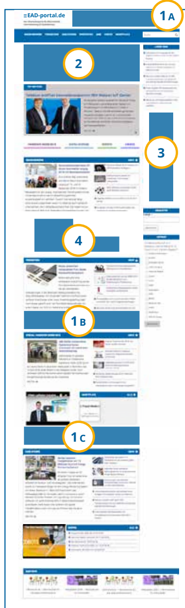
Start page desktop